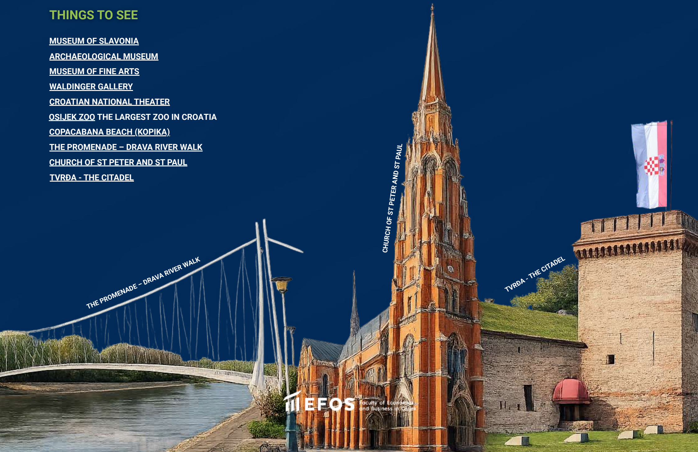
CHURCH OF ST PETER AND ST PAUL