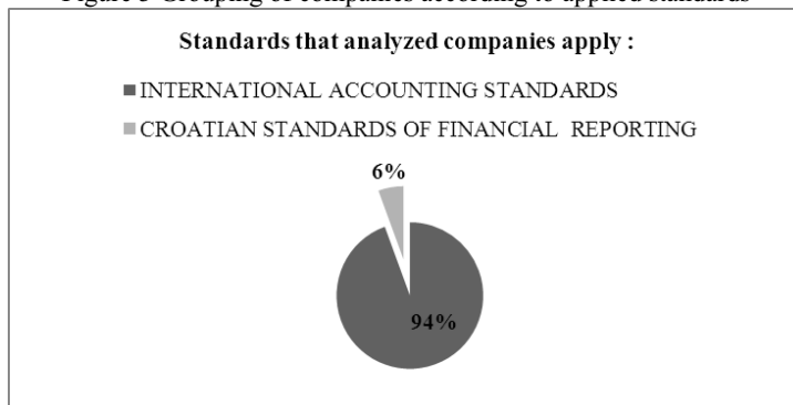
Figure 3 Grouping of companies according to applied standards

Considering the application of CFRS or the application of IFRS on the analyzed sample of 54 companies results are following: 3 companies (6%) apply CSFR while 51 companies (94%) apply IFRSs. From this it is obvious that this sample is mainly formed from big size companies.