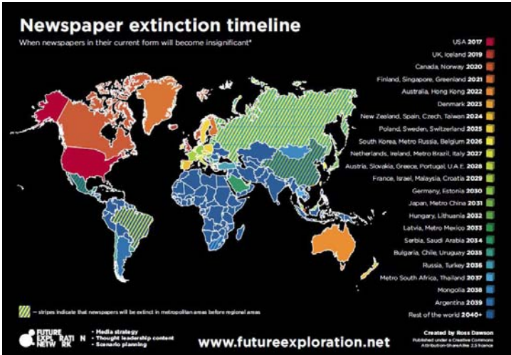
Picture 2. Newspaper extinction timeline

Immense growth of the Internet usage didn't leave everywhere positive results. According to a survey conducted by www.futureexploration.net (December 16, 2009) the end of press in Croatia could happen by 2023.